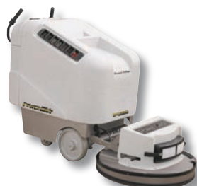
PowerGlide™ UHS Battery Burnisher