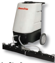
HydroStar® Stripper Applicator