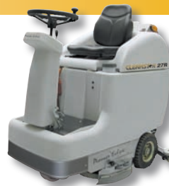
CleanStar 27R Ride-On Automatic Scrubber