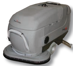
Pioneer33 Battery Automatic Scrubber