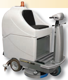
CleanStar® 30M Ride-On Automatic Scrubber