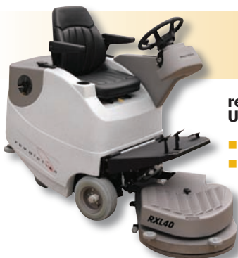
revolution® RXL40 Ride-On UHS Propane Burnisher