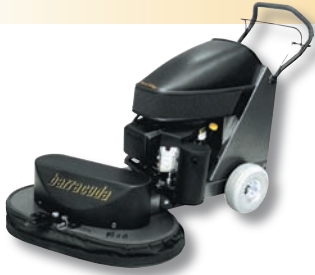
barracuda® Low Profile