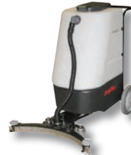
StripVac® Stripper Recovery Vacuum